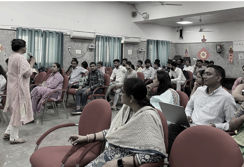
DOE Special Educators Workshops